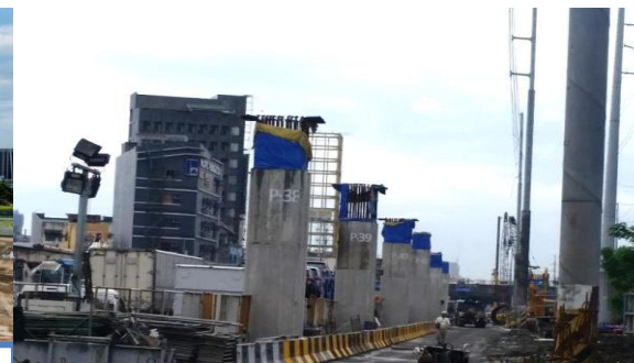
Ongoing works on Section 1