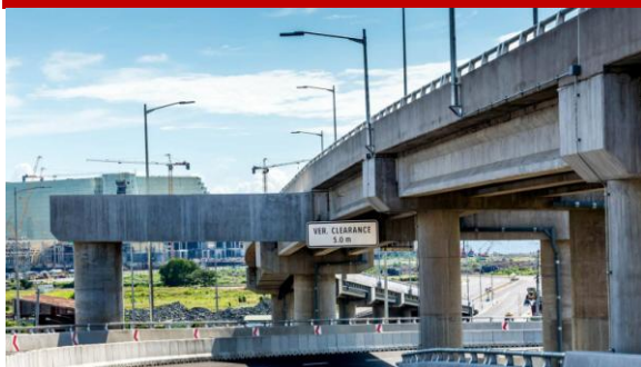
Activities along Parañaque River