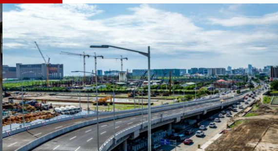
Completed ramps from Macapagal Ave. (Ramps 15-16)