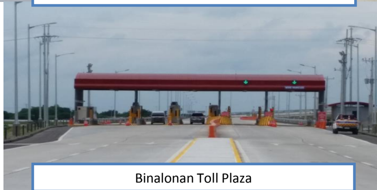
Binalonan Toll Plaza