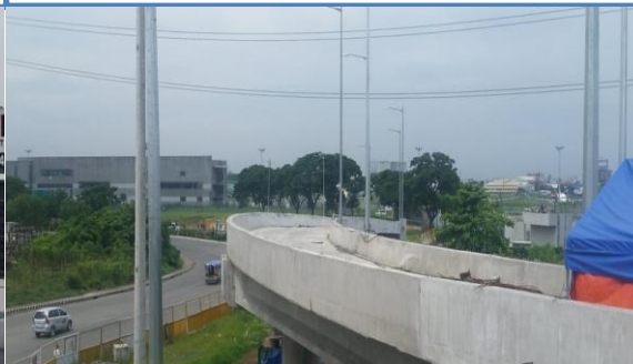
Ramp to Terminal 3 (Ramp 4)