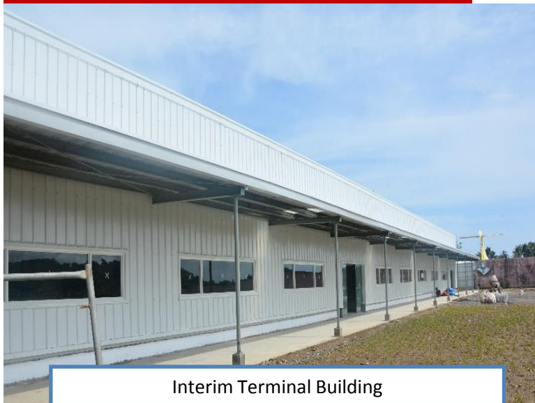
Interim Terminal Building