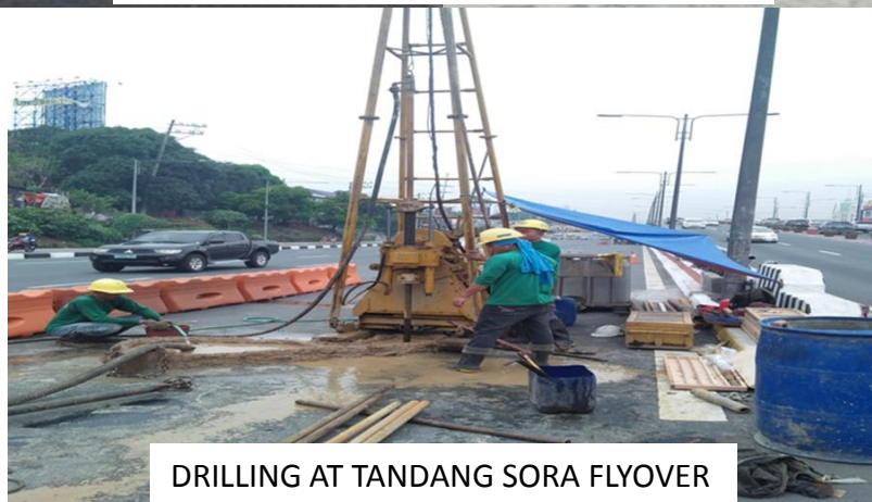
DRILLING AT TANDANG SORA FLYOVER