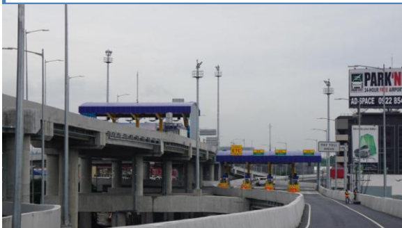
Toll Plazas in Phase 2A