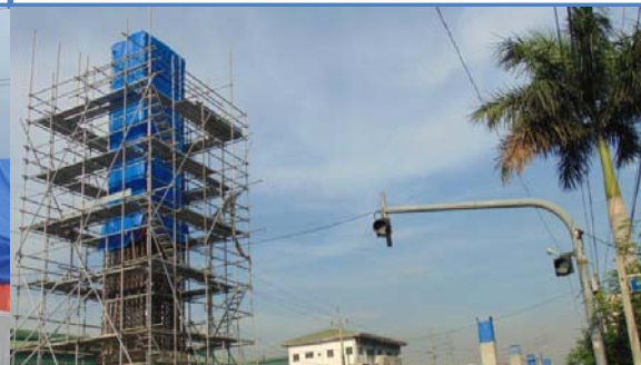
Ongoing works on Section 4