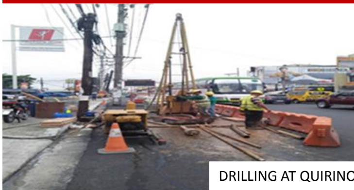
DRILLING AT QUIRINO AVE. BESIDE LAMESA