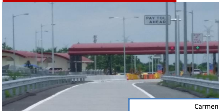
Carmen Toll Plaza