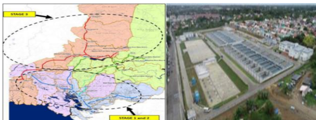
TULLAHAN RIVER AND PASIG RIVER CLEANUP