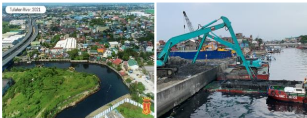
PASIG RIVER AND TULLAHAN RIVER CLEANUP