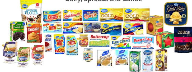
Dairy, Spreads and Coffee